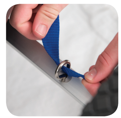
Place the rear of the boat on top of the EZ Cart and run one strap through the eye bolt on each side of the cart. Lay the ends of the strap on top of the boat.