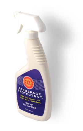
303 Protectant Extends the life of Sea Eagle inflatables. Spray on every 3045 days to improve resistance to UV rays, oil and chemicals. Prevents fading and cracking.