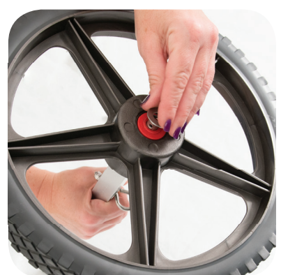
Slide the wheel onto the axle.

Note: Push the red bearing down if not fully seated.