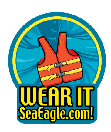
Personal Flotation Devices U.S.C.G. approved. Life jackets, paddling vest, PFD Belts available in various sizes.