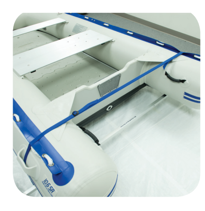
Both straps may be needed to secure the boat to the cart.