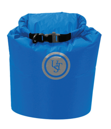
Dry Bag 5.5 liter dry bag keeps food, electronics or clothing dry.