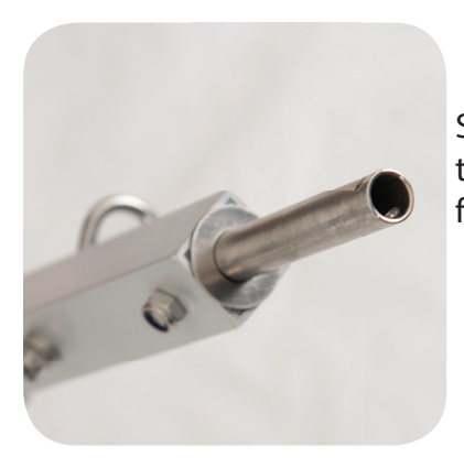
Slide 1 washer over the axle of the wheel frame.