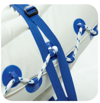
Sport Kayaks: Slide the strap under the rope on both sides of the kayak to secure.