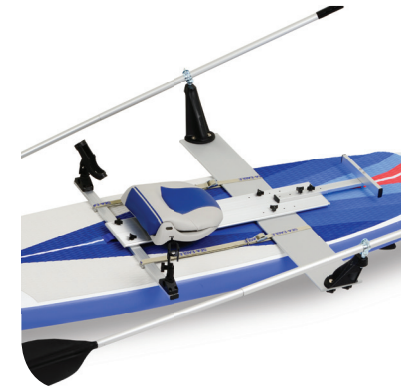
QuikRow Easily straps on to any Sea Eagle iSUP and many Sea Eagle kayaks making them true rowing machines. Optional Scotty Rod Holders available to fit the OuikRow.

Sea Eagle has a wide variety of optional accessories that can be used with Sea Eagle inflatables. To see a full line of accessories, visit SeaEagle.com/Accessories