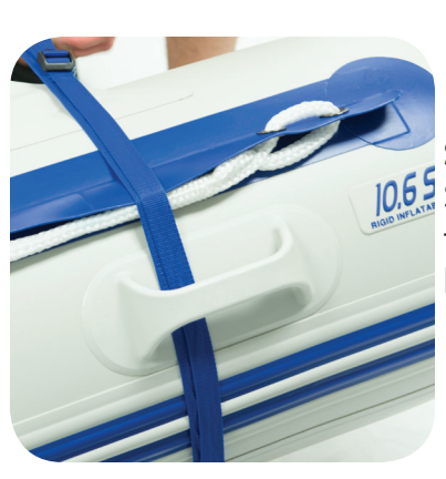
Sport Runabouts: Slide the strap through the carry handles.