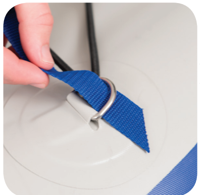
Explorer: Insert the strap through the D-rings on the spray skirt will help secure the cart to the kayak.

Most kayaks, boats & SUPs can be secured by tightening the strap(s) over the top. If traveling down a rough trail, consider securing the EZ Cart with extra care as shown below.