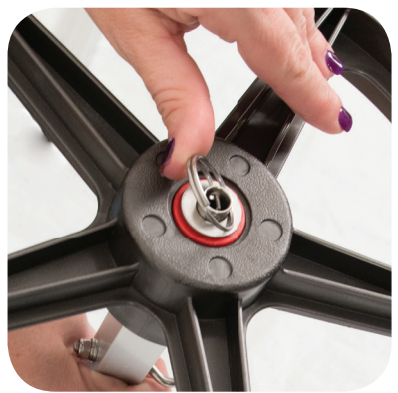
With the axle sticking through the wheel, place another washer over the top and lock into place using one of the circular lock pins.