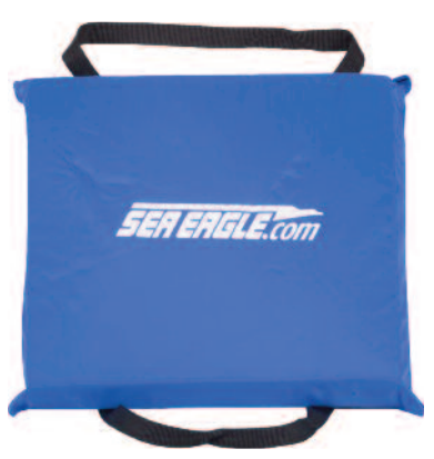
Boat Cushion PFD (OPTIONAL)

The Dry Bag has a unique fold-over clasp seal that protects goods inside the ditch bags from moisture. Can be added to or can replace bags in any ditch bag.