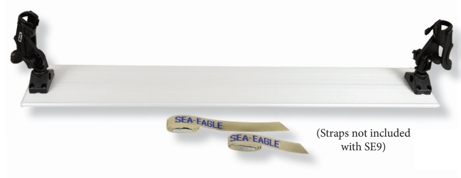
Sea Eagle Fish-n-Troll (fully assembled with 4'straps)

Check all parts are included and lay out all parts on a clean, dry area.