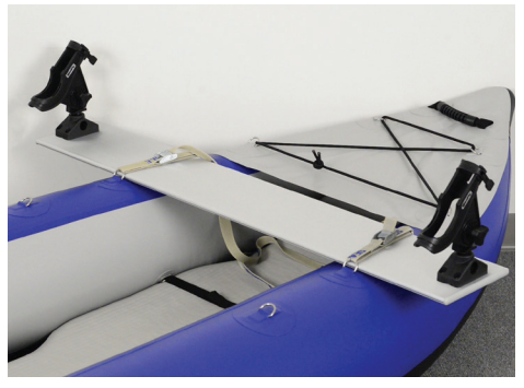
Repeat on the other side.

Adjust the angle of the rod holder by loosening the large screw knob.