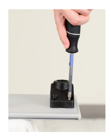
Using a #2 phillips head screwdriver, secure the mounts to the board with the #6 screws.