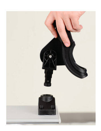
Align the slot in the rod holder with the key in the base. Push the rod holder into the base. When the key goes through the slot, turn the rod holder to the desired position, push down to lock in place.

Adjust the angle of the rod holder by loosening the large screw knob.