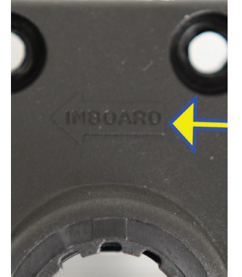
Place the bases over the holes in the board with the "INBOARD" arrow pointing to the center of the board.

Secures to the SE9 via the motormount frame and attaches to FastTrack™ and Explorer™ kayaks with adjustable self-locking straps.