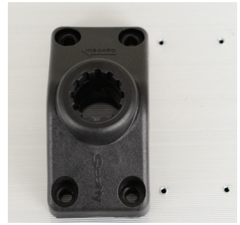
Remove the Scotty Deck mount bases from the rod holders. The bases attach to the 4 holes on either side of the board.