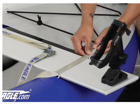
Flip a 4' strap upside down and slip the end through the front d-ring, then through the back d-ring.